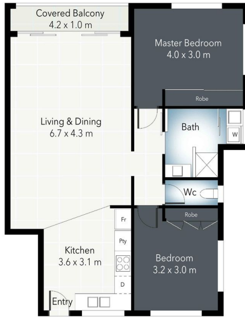
UNIT 3 FLOOR PLAN