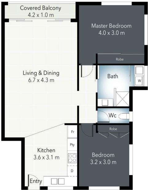
UNIT 3 FLOOR PLAN

FLOOR AREA SIZES Internal 106 m 2 External 5 m 2 Total 111 m 2