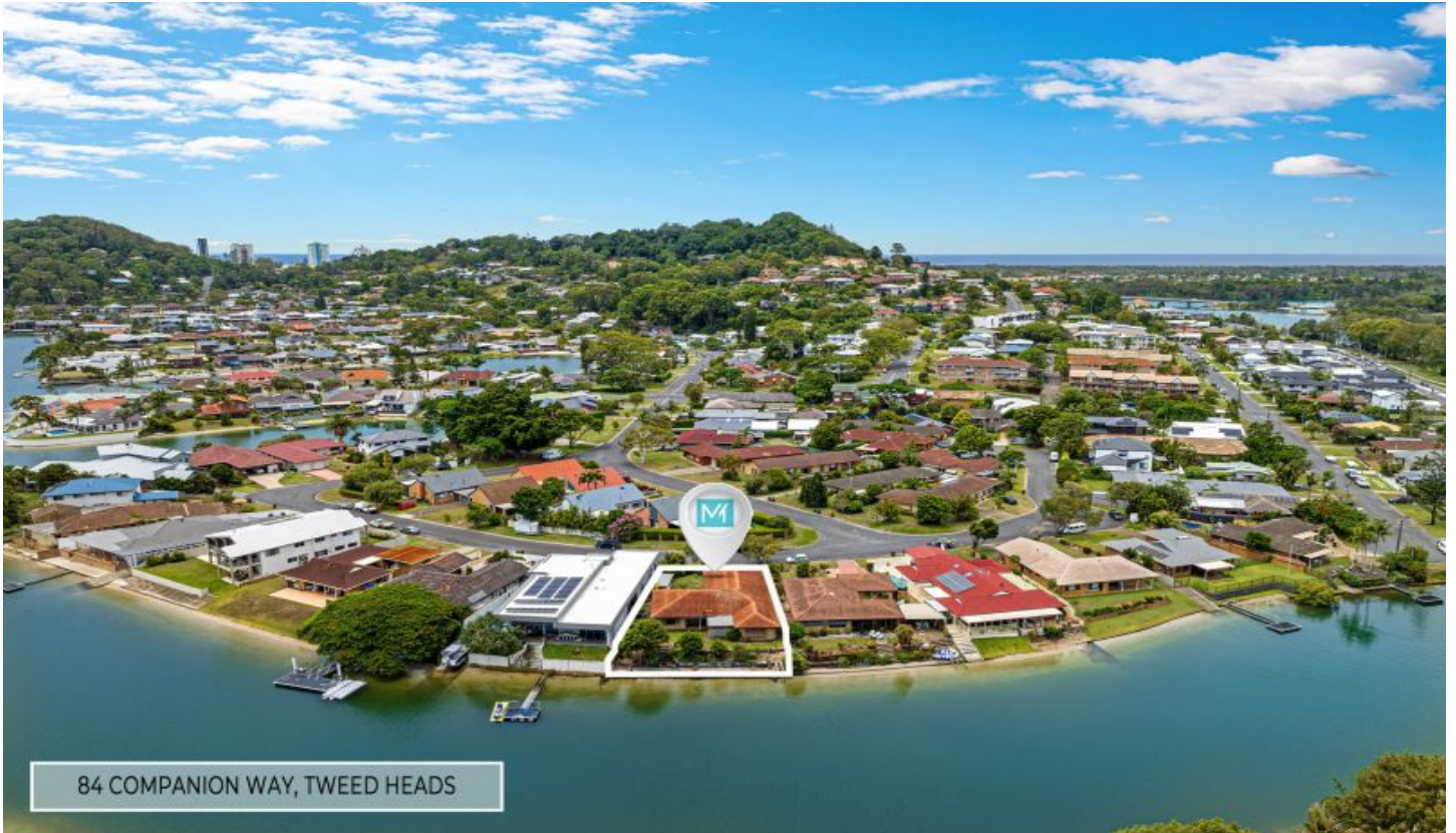
84 COMPANION WAY, TWEED HEADS