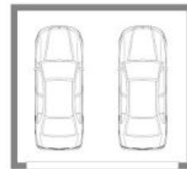
garage 5.6 x 5.0 m